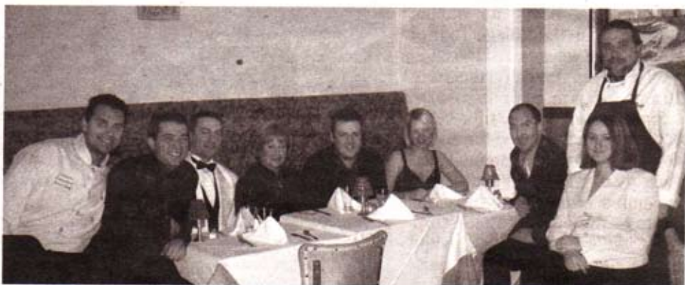
The cast of "Broadway A La Carte" is seen here with the Soldano family.